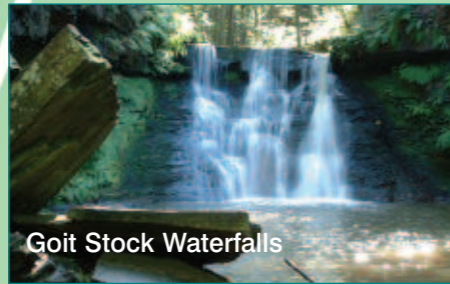
Goit Stock Waterfalls